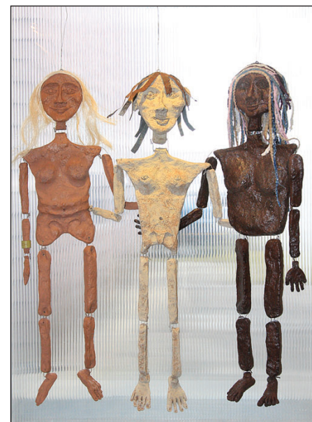
'Three Graces' by Rondi Casey at Art Sites.